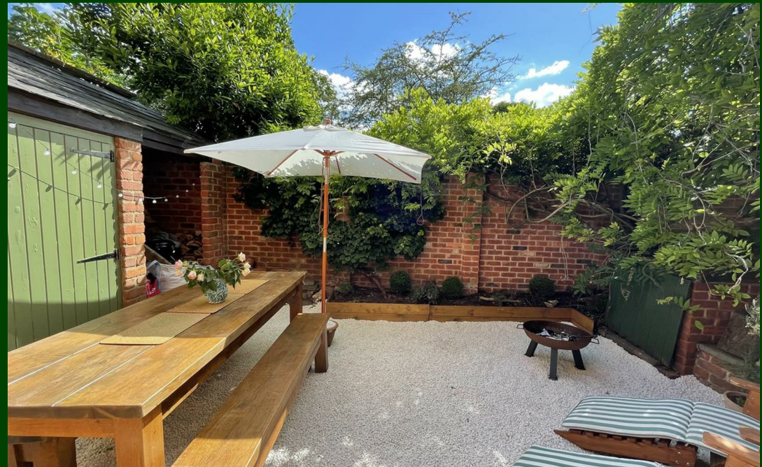
1 Church Street Charlbury Oxfordshire OX7 3PW Telephone: 01608 811146